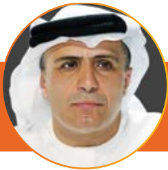
His Excellency Mattar Al Tayer Director General, Chairman of the Board of Executive Directors of the Roads and Transport Authority (RTA), Dubai, UAE

The rehabilitation techniques and programmes provided by the event to its visitors are the best evidence of this, in addition to the event’s ability to attract people of determination, their families, and those working with them from the different countries of the world, to learn about the services that support them in the fields of education, employment, home, and other recreational and community services, hence enabling them to live independently on an equal footing with others.”